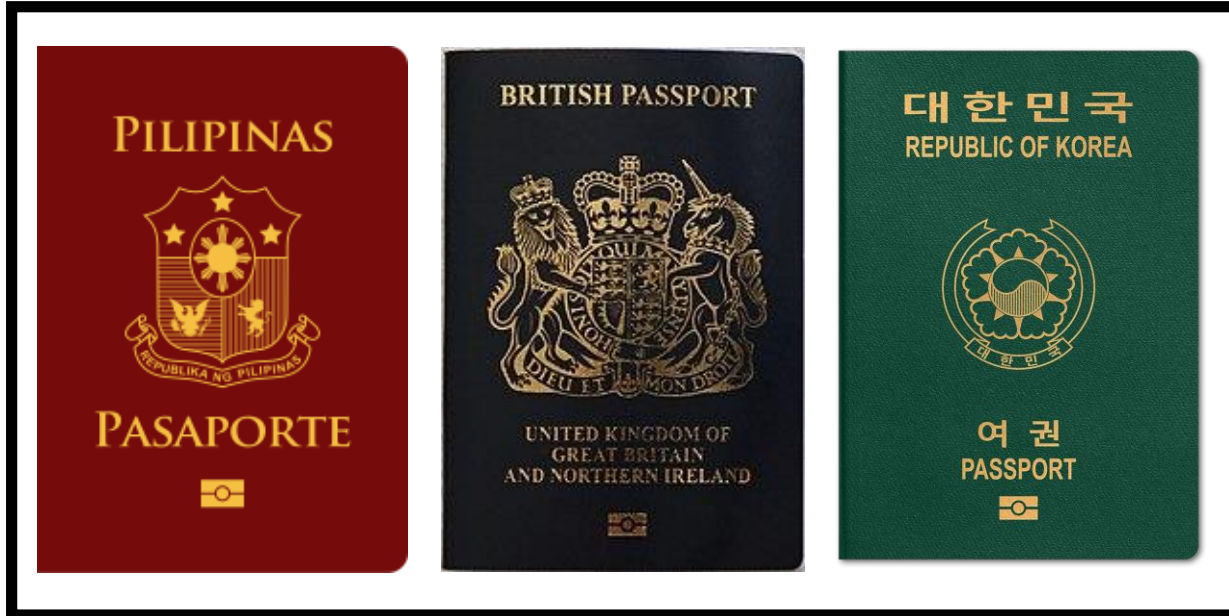
Passport with Valid Visa Stamp