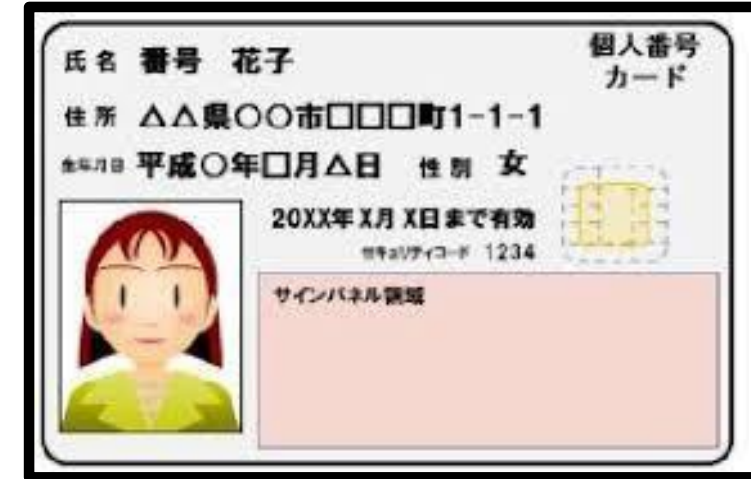
My Number Card (Kojin Bango Card) Photo ID Version Only