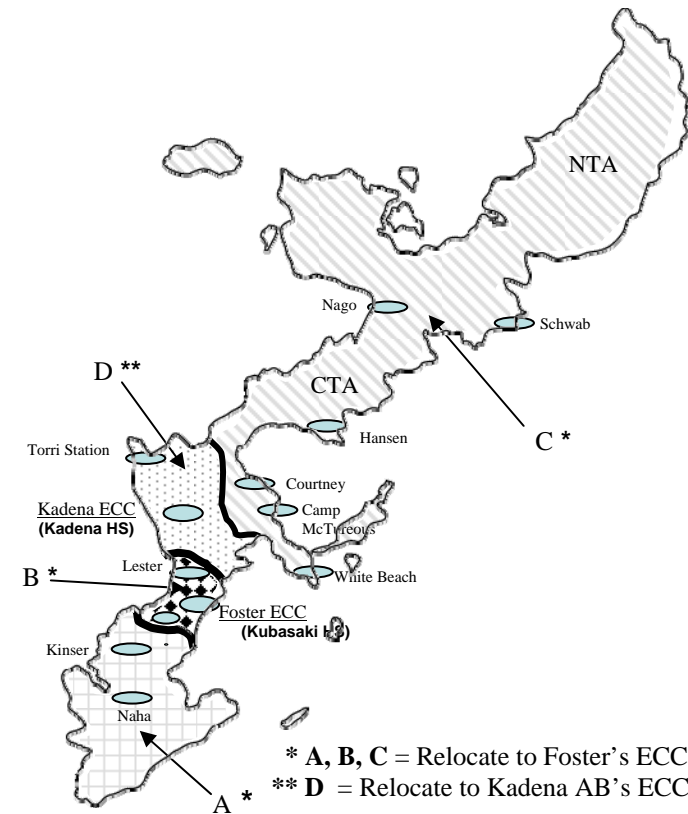
Figure 2 Four Okinawa Evacuation Zones

• EVAC-R: [Assess, Reconcile] The situation will dictate whether U.S. citizens will return to Okinawa or be permanently relocated. If permanently relocated, evacuees will work with military and Satae Department representatives to reconcile household goods.